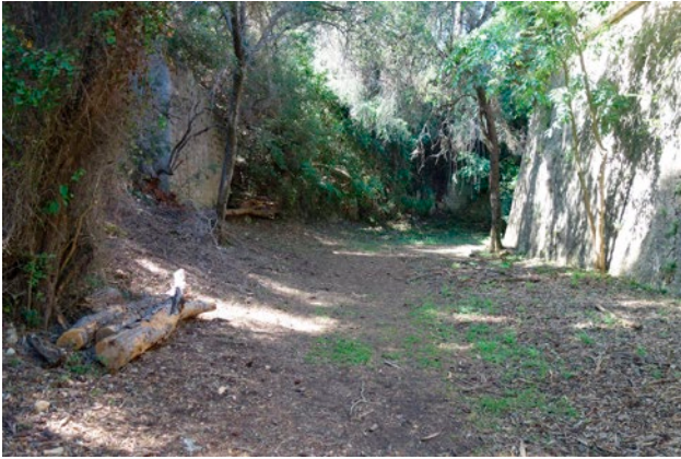
Fig. 2. Habitat of Anguis veronensis from Sainte-Marguerite Island, southeastern France.

A statistical parsimony network was constructed for nuclear PRLR haplotypes using TCS v. 1.21 with 95% as disconnection limit (Clement et al., 2000), by including the haplotypes found in this study and those reported by Gvoždík et al. (2013).